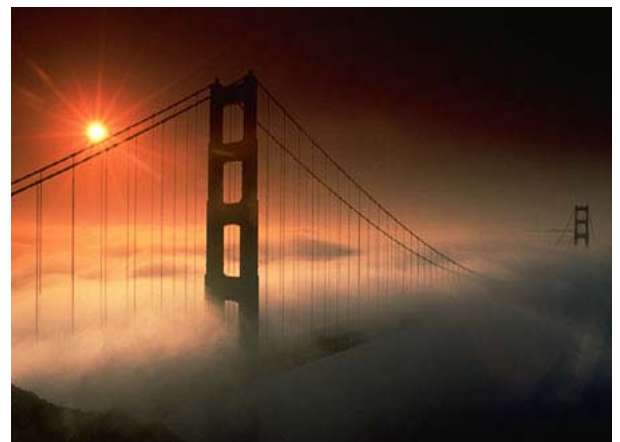
The Dialogue for Action Summit focused on bridging the gaps and barriers associated with colorectal cancer screening in NYS.

For more information on the summit, outcomes or colorectal screening in New York State, please email nyscccp@cancer.org .